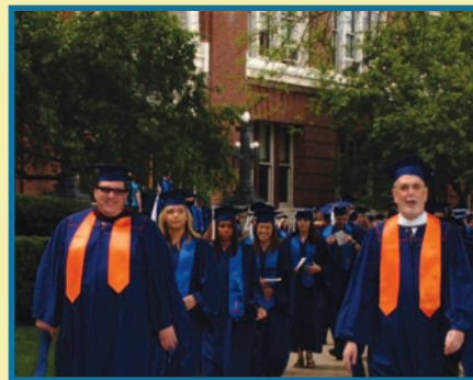
Students are marshalled out of Lincoln Hall to Foelinger Auditorium prior to the graduation ceremony.